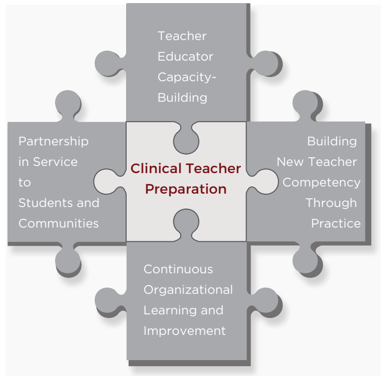
FIGURE 1 The Four Drivers of High Quality Clinical Teacher Preparation

This extensive review of the research has illuminated the critical intersections between and among each quality driver, suggesting that effective clinical preparation programs accomplish multiple goals through the development of new cross-organizational systems and the creation of strategic alliances. The four drivers of quality cannot be viewed as mutually exclusive; they are an intricate and interconnected web existing in service to high-quality, clinically based teacher preparation (see Figure 1).